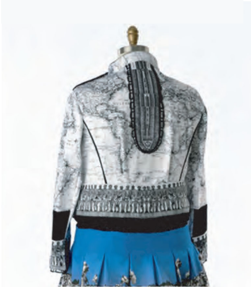
Elka Stevens , Stowage Coat & Cotton from the Slave to Fashion Series , Fiber - cotton Sateen, cotton velveteen, cotton thread, polyester trim, resin buttons, Size 20, 2013.